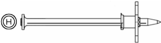
FIGURE 2—HILTI X-CP SILL PLATE FASTENER