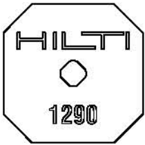
FIGURE 3—HILTI X-CF WASHER