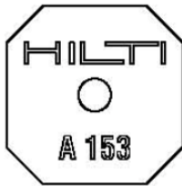
FIGURE 4—HILTI X-CP WASHER